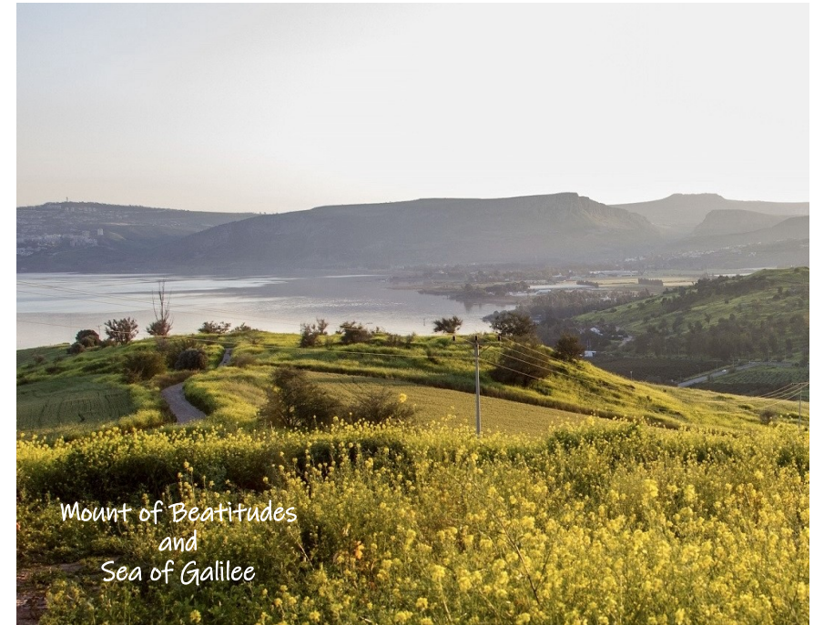
Mount of Beatitudes and Sea of Galilee

“Blessed are those who hunger and thirst for righteousness, for they will be filled.” — Matthew 5:6